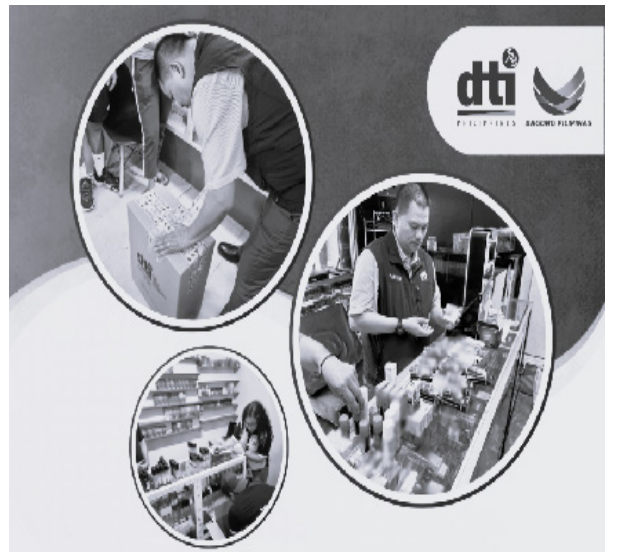
DTI Seizes Over P300K of Illegal Vape in Quezon City Ops

The team inspected a total of 79,515 firms, which resulted to the confiscation of 18,526 vape products worth Php5,559,607.00. This resulted to the issuance of 212 Notices of Violation (NOV) and 473 Show Cause Orders (SCOs). Meanwhile, RA 11900 vests the regulatory jurisdiction over vapes and other novel tobacco products to the DTI and complementary implementing roles to DOH, FDA, DSWD, DEPED, BIR and LGUs. The DTI urges the consumers to report violators of retailers, distributors, and manufacturers that sell uncertified items through the Consumer Care Hotline at DTI (1-384) or consumercare@dti.gov.ph. Source: DTI